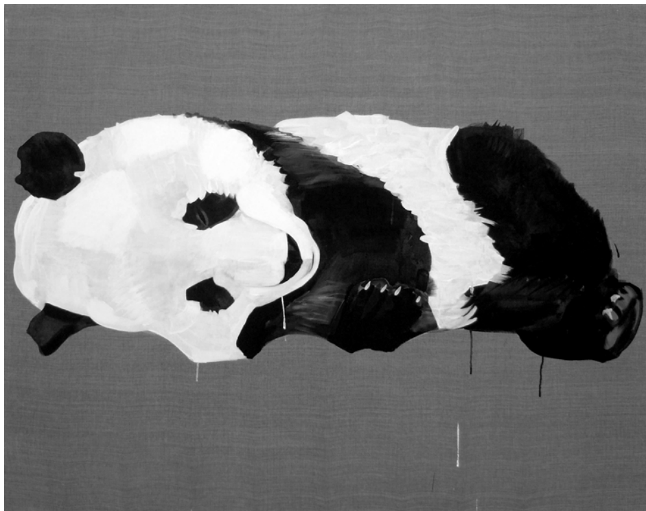
Simon Popper, Sleeping Panda , 2008 (courtesy of the artist & Rachmaninoff's, London)

London-based artists Celine Condorelli and Simon Popper present an evening of entertainment that draws on the French composer and pianist Erik Satie's concept of 'furnishing music' for events, soirees and meetings. In Satie's words: 'What is furnishing music? A pleasure! Furnishing music replaces waltzes and operas ... Do not be mistaken, it is something else!!! No more false music but musical furniture! Furnishing music completes your belongings, it allows for everything; it is worth gold; it is new; it does not disturb habits; it is not tiring; it does not run out; it is not boring. To adopt it is to do better! Listen at ease!'. This event furnishes the park with music for trees and large animals.