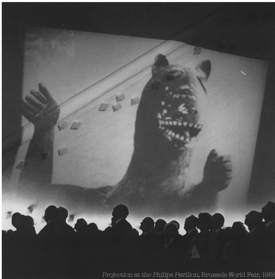
Projection at the Philips Pavilion, Brussels World Fair, 1958

at specific intervals (as a result, the performance never sounded exactly the same in any specific location), while Iannis Xenakis' Concrète PH played as an interlude between shows.